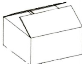
Isothermal shield of 3layers KTEMP